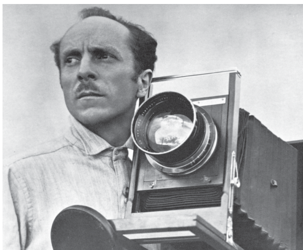
Photo 5. Edward Weston with camera