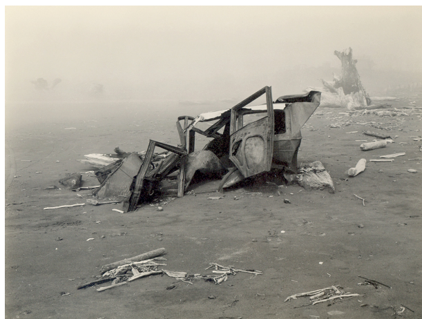
Photo 17. Wrecked Car, Crescent Beach, 1939

We see the skeletal remains of a car planted in the soft sand of a misty beach, strewn with debris. The muted light joins with the form of this discarded wreck: lively geometric shapes that rise and fall. Weston chose a point-of-view that gives the wreck an upward diagonal — which culminates in a vertical, misshapen tree stump in the