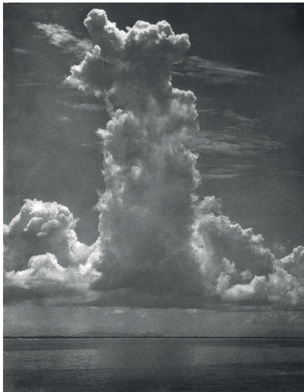
Photo 7. The Great White Cloud of Mazatlan

He writes of seeing this “sunlit cloud which rose from the bay to become a towering white column” [1, p. 7]. It is a striking oneness of low and high, vertical structure rising from a base that mirrors the horizon line where water meets sky. This cloud also seems to me both hard and soft at once, maintaining its billowy outline, at the same time it becomes diffuse at the edges and mingles with the surrounding sky. A oneness of opposites, it does not “preside in mighty isolation” [3, p. 119].