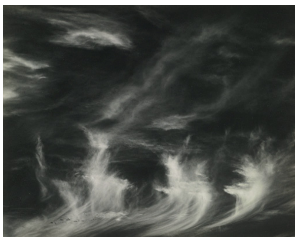
Photo 4. Clouds