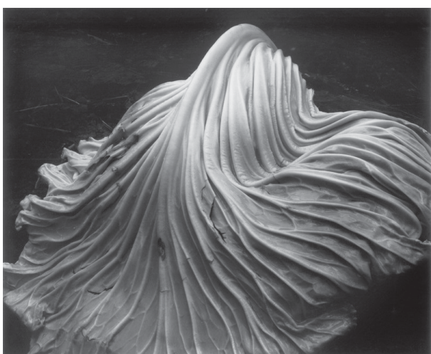
Photo 1. Cabbage Leaf

I think that people looking at a Weston photograph of a cabbage leaf (Photo 1), sand dunes (Photo 2), a landscape (Photo 3), or clouds (Photo 4), have been taken by the strange and sometimes wondrous forms he found in them, “the universe that is under one’s nose and is far away” [Ibid.].