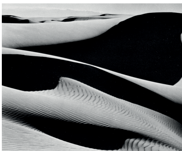
Photo 2. Sand Dunes