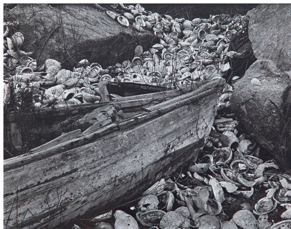
Photo 18. Boat and Abalone Shells

In this 1938 photograph, “Boat and Abalone Shells,” we see an old, discarded boat thrusting its way on an upward diagonal into the picture frame.