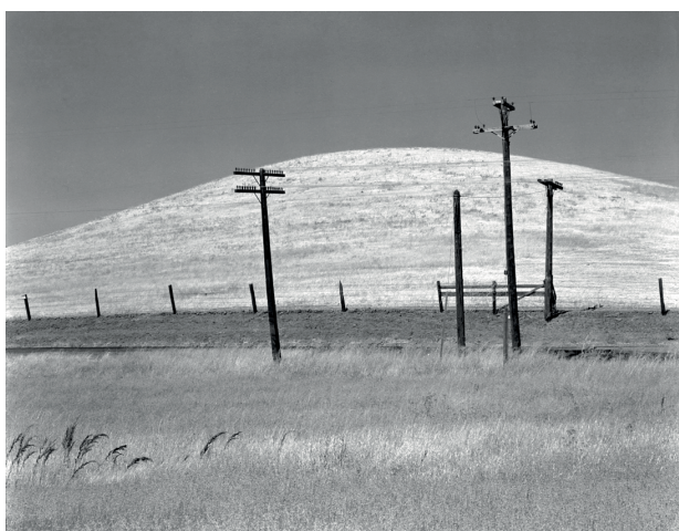
Photo 3. Landscape