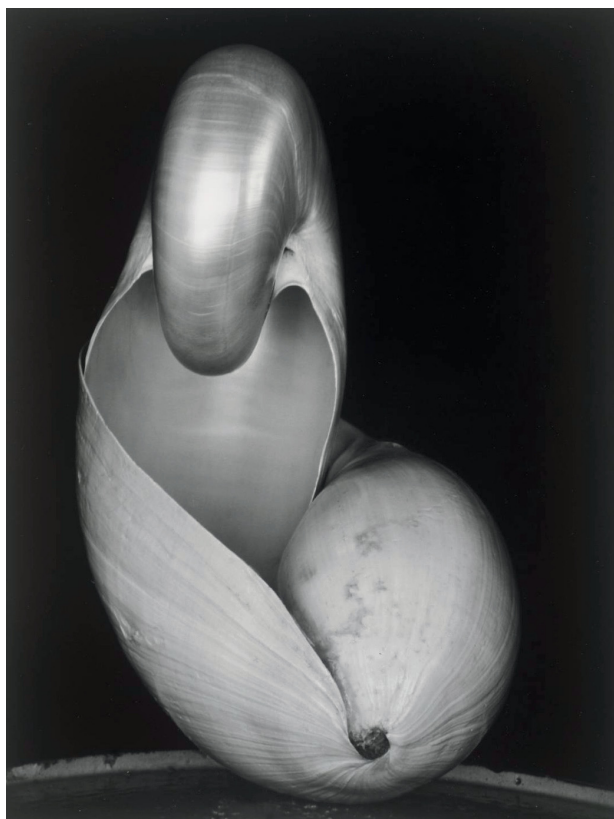
Photo 16. Two Shells

Weston wanted to know why a photograph, an impression of reality captured on a flat piece of paper “should affect one emotionally,” asking, “what prompted me to record it...and who is there to tell me?” [3, p. 91].