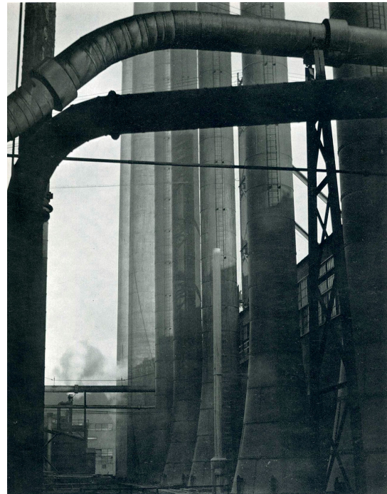
Photo 6. Armco Steel, 1922

We see vertical smokestacks crossed by two horizontal pipes: they are sharply defined in the foreground and become progressively softer as they recede into the background. Through Weston's choice of camera position, he made these lofty stacks close, overlapping, joining what is near to us and distant. He shows hard industrial pipe yielding — see how the dark vertical pipe on the left curves to become horizontal, while